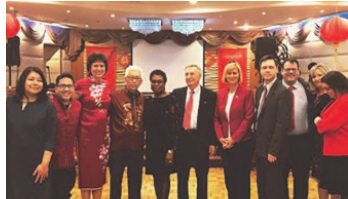
Celebrating Chinese New Year with Halton Region Chinese Canadian Association! Happy Lunar New Year.