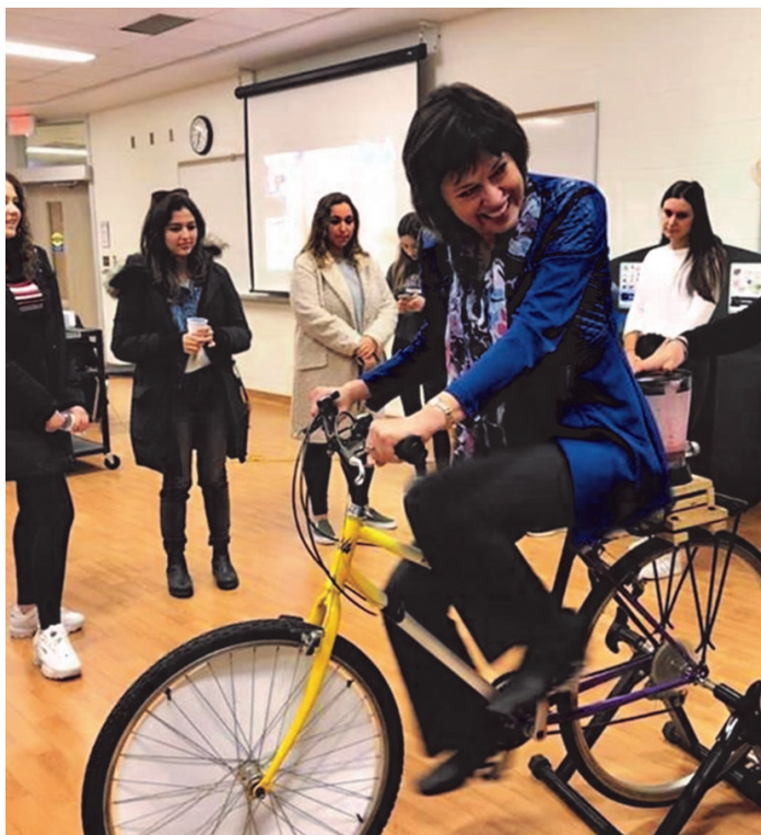
Halton Food for Thought joined my Youth Council this month to share with them the importance of healthy eating and the reality of food insecurity in Halton, as well as a hands-on activity that gave the Youth Council an idea of choices families often have to make around healthy eating. We made smoothies on the smoothie bike..