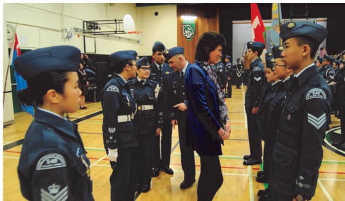
I was proud to inspect the 540 Golden Hawks Squadron RCACS, one of the largest air cadet squadrons in Canada.