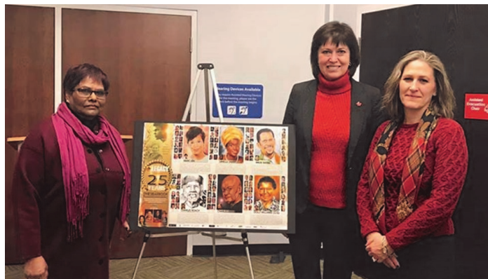
I joined the Burlington Caribbean Connection at Burlington City Hall to recognize Black History Month with Mayor Meed-Ward.