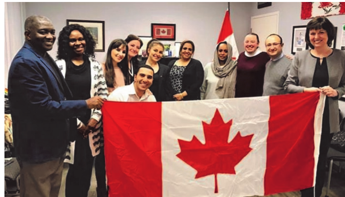
Welcome to Oakville North- Burlington's newest Canadian citizens! Thank you to everyone for sharing your stories with me.